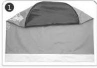
1. Unfold the bathtub